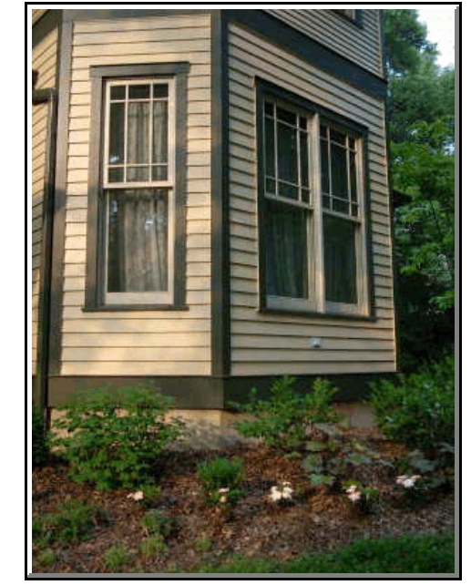
These windows may look original, but they are indeed replacement windows. Match the right windows with a great installer who is a craftsman, and you can fool anyone.

If I were you, I would want windows that have passed a battery of tests created by one or more independent certification organizations. The materials used to make the window must be